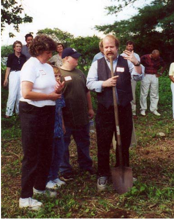
Breaking ground with our new Habitat family