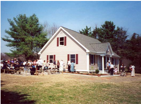
And now it's moving time!