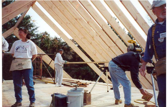
Building goes fast with many volunteers